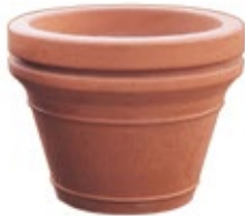
TERRENE SERIES TF4043 20" DIA. X 18" 175 lbs. TF4041 28" DIA. X 22" 315 lbs. TF4042 36" DIA. X 29" 675 lbs.