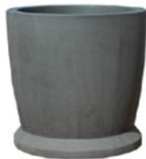
TF4101 36" DIA. X 36" 1,150 lbs. TF4121 48" DIA. X 30" 1,450 lbs.