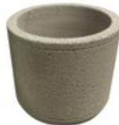
FORM SERIES TF4070 18" DIA. X 24" 305 lbs. TF4085 30" DIA. X 30" 785 lbs.