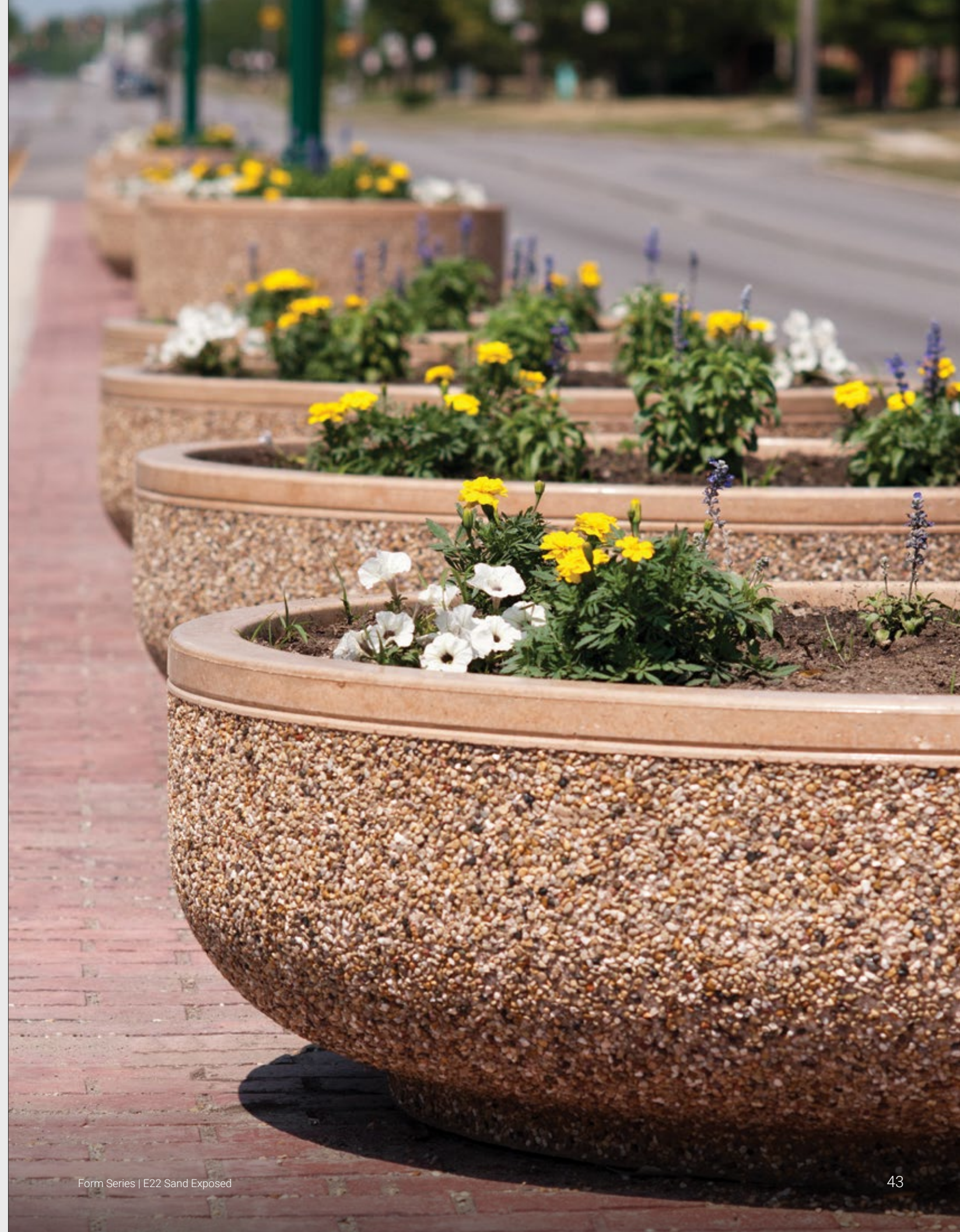
Form Series | E22 Sand Exposed