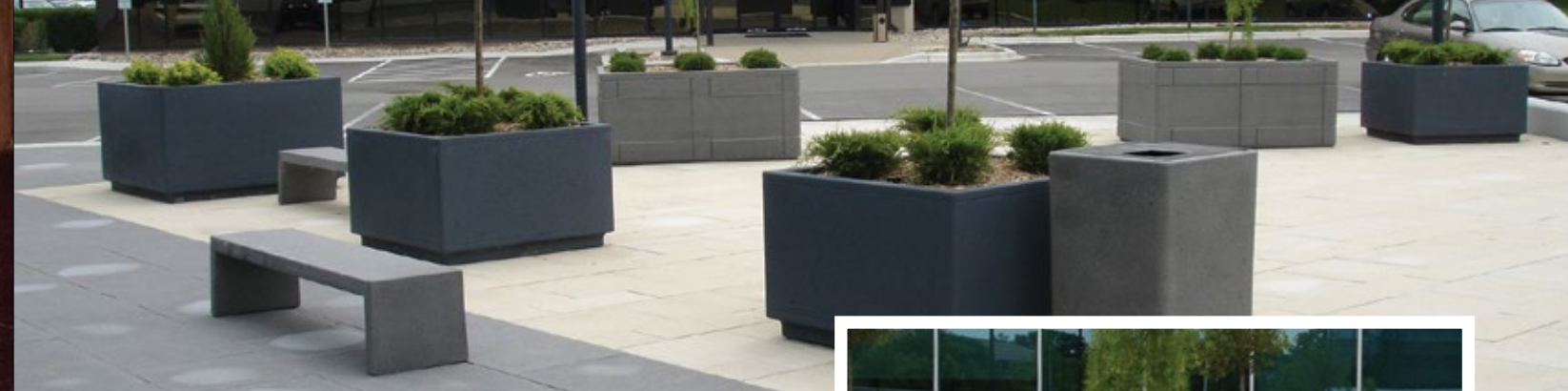
TF4183 & TF4205 | Custom Colors