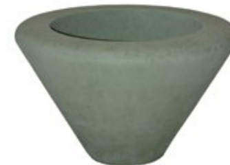
WS102 19" DIA. X 21" 110 lbs. WS103 22" DIA. X 21" 225 lbs. WS104 26" DIA. X 21" 350 lbs. WS105 30" DIA. X 21" 400 lbs. WS106 34" DIA. X 21" 540 lbs.