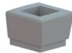
WS9126 24" SQ. X 18" 630 lbs. Also available as bench - WS912