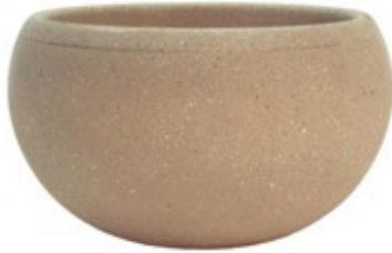
BELTLESS SERIES TF4352 36" DIA. X 24" 750 lbs. TF4353 42" DIA. X 24" 1,000 lbs.