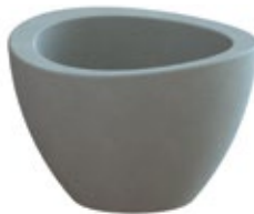
ECLIPSE SERIES TF4004 24" DIA. X 16" 220 lbs. TF4003 36" DIA. X 23" 500 lbs. TF4001 38" DIA. X 38" 990 lbs.

See pg. 51 for planter bases to pair with Dish Series