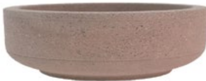
FORM SERIES TF4105 42" DIA. X 17" 750 lbs. TF4125 60" DIA. X 17" 1,450 lbs.