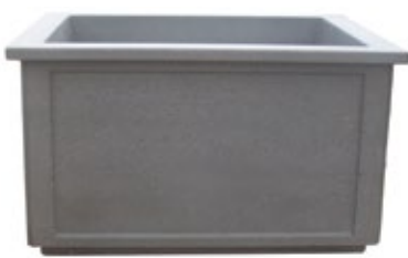
TF4208 64" X 52" X 36" 3,050 lbs.