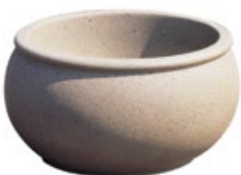
ELLIPTICAL SERIES TF4339 30" X 24" X 16" 300 lbs. TF4340 36" X 30" X 18" 495 lbs. TF4341 42" X 36" X 20" 670 lbs.