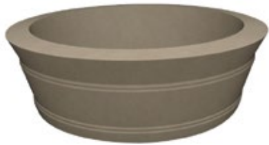
TF4363 58 1/4" DIA. X 18 3/8" 1,332 lbs.