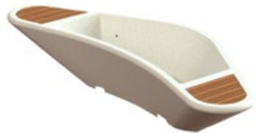
CONCRETE WITH WOOD SEATING DF5335 98" X 40" X 17 1/2" 1,350 lbs.