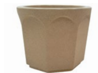
TF4025 30" DIA. X 24" 370 lbs.