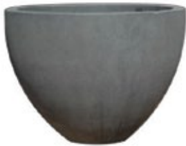
VCC SERIES TF4086 30" DIA. X 42" 800 lbs. TF4122 48" DIA. X 36" 1,220 lbs. TF4132 60" DIA. X 42" 1,700 lbs.