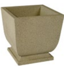
WS450 24" SQ. X 30" 520 lbs.