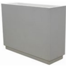
TF4355 36" X 16" X 36" 1,035 lbs. TF4356 48" X 16" X 36" 1,200 lbs. TF4357 60" X 16" X 36" 1,630 lbs.