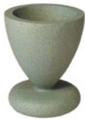
WS445 24" DIA. X 29 1/2" 520 lbs.