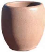
BELTLESS SERIES TF4350 18" DIA. X 25" 350 lbs. TF4351 24" DIA. X 26" 460 lbs.