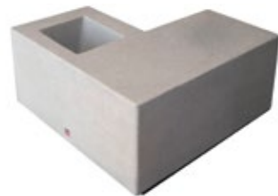
WS118 36" X 36" X 18" 960 lbs.