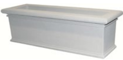
TF4192 36" X 24" X 22" 640 lbs. TF4194 60" X 36" X 36" 2,100 lbs.