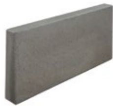
2 PLANTER EXTENSIONS FOR DF5515 DF5520 48" X 5 1/2" X 22" 504 lbs.