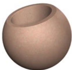
WS111 36" DIA. X 32" 1,230 lbs.