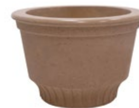
TF4051 30" DIA. X 20" 320 lbs.