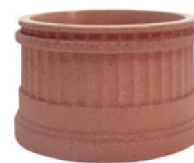
TF4230 36" DIA. X 24" 730 lbs.