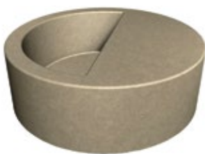
WS122 48" DIA. X 18" 1,600 lbs.