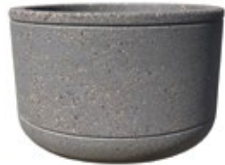
FORM SERIES TF4075 24" DIA. X 17" 305 lbs. TF4090 36" DIA. X 24" 785 lbs. TF4095 36" DIA. X 26" 875 lbs. TF4100 36" DIA. X 30" 885 lbs. 48" DIA. X 30" 1,325 lbs. Leveling ring comes with TF4095