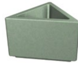
WS117 36" X 36" X 36" X 22" 750 lbs.