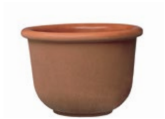
SENORA SERIES TF4045 18" DIA. X 12" 110 lbs. TF4050 18" DIA. X 24" 180 lbs. TF4055 30" DIA. X 24" 390 lbs. TF4060 42" DIA. X 24" 660 lbs. TF4065 60" DIA. X 41" 1,960 lbs.