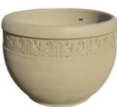
WESTLAKE SERIES TF4229 48" DIA. X 35" 1,350 lbs. See pg. 15 for Westlake patterns