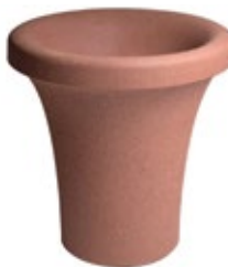
WS409 24" DIA. X 30" 365 lbs. WS4091 24" DIA. X 36" 485 lbs.