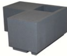
WS119 36" X 36" X 18" 1,075 lbs.