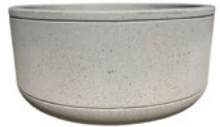
FORM SERIES TF4080 30" DIA. X 17" 440 lbs. TF4110 48" DIA. X 24" 1,100 lbs. TF4115 48" DIA. X 26" 1,600 lbs. TF4129 60" DIA. X 30" 2,200 lbs. TF4130 60" DIA. X 36" 2,450 lbs. Leveling ring comes with TF4115