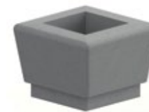
WS913 24" SQ. X 18" 670 lbs. Also available as bench - WS9113