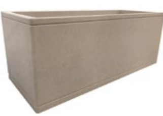
FORM SERIES TF4182 48" X 30" X 24" 1,100 lbs. TF4170 72" X 18" X 24" 1,360 lbs. TF4169 66" X 18" X 30" 1,400 lbs. TF4175 72" X 30" X 30" 1,675 lbs. TF4180 96" X 30" X 30" 2,700 lbs. TF4213 96" X 48" X 36" 4,300 lbs.