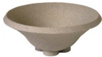
WS435 36" DIA. X 15" 275 lbs.