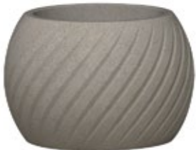
TF4007 36" DIA. X 24" 2,172 lbs.