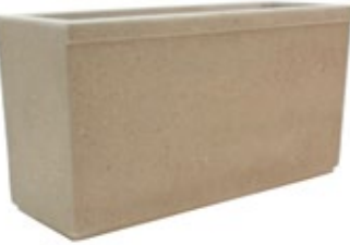
RP SERIES TF4150 36" X 18" X 14" 330 lbs. TF4160 48" X 18" X 14" 365 lbs. TF4155 36" X 18" X 25" 540 lbs. TF4165 48" X 18" X 25" 700 lbs.