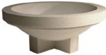
PRAIRIE SERIES SL4034 36" DIA. X 19" 430 lbs. SL4035 42" DIA. X 19" 625 lbs. SL403 48" DIA. X 18" 830 lbs. SL4031 72" DIA. X 28 1/2" 2,150 lbs. SL4036 96" DIA. X 38" 5,800 lbs.