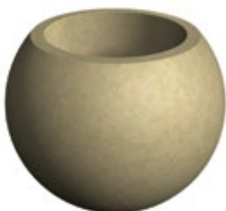
WS110 36" DIA. X 32" 1,530 lbs.