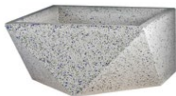
WS124 36" SQ. X 18" 850 lbs.