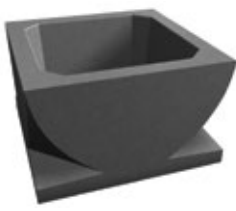
WS107 30" SQ. X 18" 745 lbs. WS108 30" SQ. X 30" 1,135 lbs.