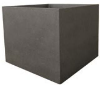
TF4358 48" SQ. X 42" 2,750 lbs.