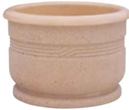
CLASSICAL SERIES WS4027 26" DIA. X 24" 430 lbs. WS4026 36" DIA. X 24" 675 lbs.