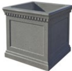
COLONIAL SERIES TF4184 14" SQ. X 24" 205 lbs. TF4236 24" SQ. X 20" 425 lbs. TF4240 36" SQ. X 30" 1,000 lbs. TF4242 36" SQ. X 36" 1,500 lbs. TF4243 72" SQ. X 48" 4,620 lbs.