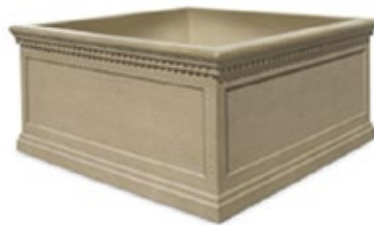
COLONIAL SERIES TF4237 72" SQ. X 36" 3,792 lbs. TF4244 96" SQ. X 48" 7,225 lbs.