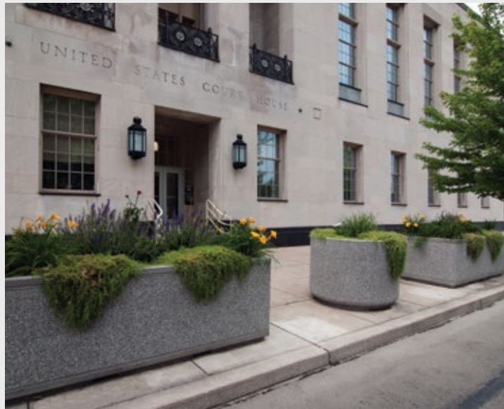
Form Series | E33 Misty Exposed