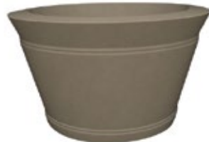
TF4366 35 5/8" DIA. X 22 3/8" 641 lbs. TF4364 48" DIA. X 28 3/8" 1,332 lbs.