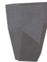
TF4361 28" X 32 1/4" X 46" 1,160 lbs.