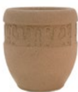
WESTLAKE SERIES TF4228 24" DIA. X 26" 430 lbs. See pg. 15 for Westlake patterns