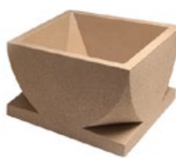
WS4051 24" SQ. X 18" 520 lbs.