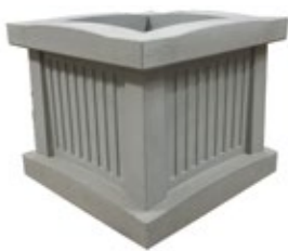
WS404 28" SQ. X 24" 870 lbs. Also available in plastic - WS4250