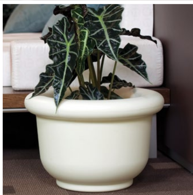
TF4046 | Custom Plastic

Wausau Tile has a vast array of shapes, sizes and configurations, or for a one-of-a-kind composition, collaborate with our skilled designers to create custom styles. Adding flowers, trees or greenery can breathe new life into your landscape.