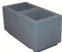
WS121 36" X 18" X 18" 680 lbs.