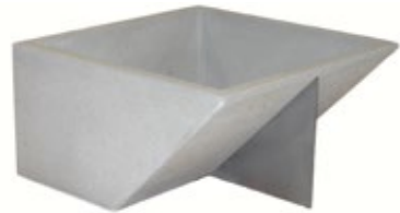
CONCRETE WITH STAINLESS STEEL FIN WS313 36" SQ. X 18" 850 lbs.