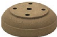
PLANTER BASES TF41493 23" DIA. X 6" 175 lbs. TF41492 24" DIA. X 7" 235 lbs. TF4149 31" DIA. X 6" 380 lbs.