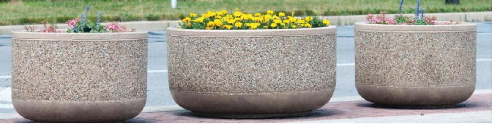
Form Series | E21 Buff Exposed