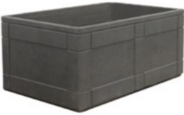
TF4183 72" X 48" X 33" 2,880 lbs.