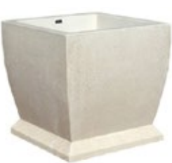
TF4191 30" SQ. X 30" 1,150 lbs. TF4204 48" SQ. X 30" 1,700 lbs.