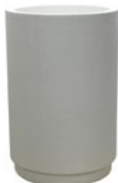
TF4354 24" DIA. X 36" 755 lbs.