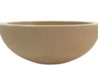
VCC SERIES TF4106 48" DIA. X 18" 650 lbs. TF4128 60" DIA. X 18" 900 lbs.