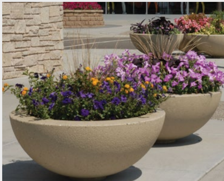
TF4106 | W22 Sand Weatherstone