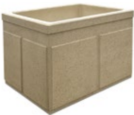
TF4202 48" X 36" X 36" 2,010 lbs.