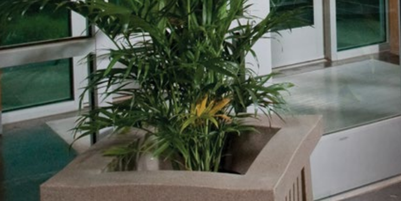
WS4250 | 58 Beige Granite Plastic