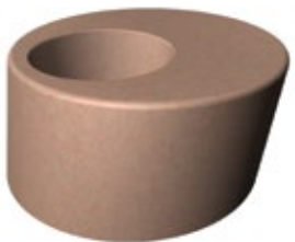
WS114 48" DIA. X 24" 3,100 lbs. WS115 60" DIA. X 24" 4,470 lbs.