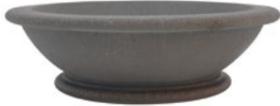
TF4133 60" DIA. X 18" 1,200 lbs.