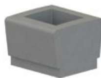
WS9033 24" SQ. X 18" 740 lbs. Also available as bench - WS903