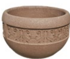
WESTLAKE SERIES TF4220 36" DIA. X 24" 700 lbs. TF4226 42" DIA. X 24" 950 lbs. See pg. 15 for Westlake patterns