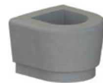
WS9073 24" X 24" X 18" 575 lbs. Also available as bench - WS907