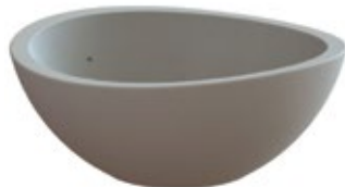
ECLIPSE SERIES TF4002 44" DIA. X 17 1/2" 540 lbs.