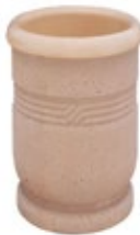
CLASSICAL SERIES WS4028 18" DIA. X 24" 300 lbs.