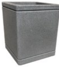
FORM SERIES TF4185 18" SQ. X 24" 390 lbs. TF4190 30" SQ. X 30" 1,060 lbs. TF4195 36" SQ. X 30" 1,400 lbs.