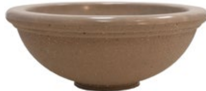
DISH SERIES TF4146 36" DIA. X 18" 400 lbs. TF4144 48" DIA. X 18" 680 lbs. TF4107 40" DIA. X 24" 745 lbs. TF4143 72" DIA. X 18" 1,460 lbs.

See pg. 51 for planter bases to pair with Dish Series