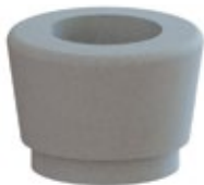
WS9086 24" DIA. X 18" 465 lbs. Also available as bench - WS908