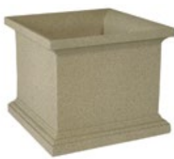
WS440 28" SQ. X 30" 1,000 lbs.