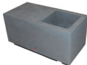
WS120 36" X 18" X 18" 715 lbs.