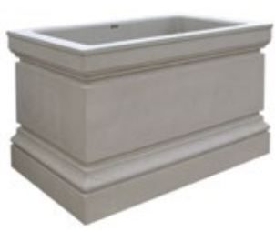
WS4241 48" X 30" X 36" 1,900 lbs.