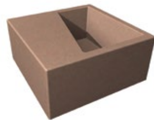
WS123 36" SQ. X 18" 1,800 lbs.