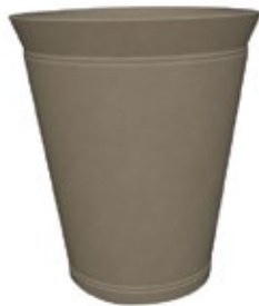
TF4365 41 1/4" DIA. X 47 3/8" 1,419 lbs.