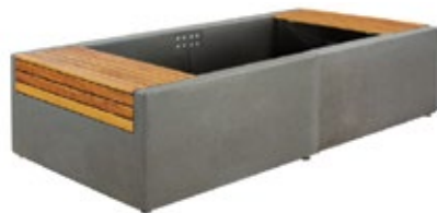
2 PIECE CONCRETE WITH WOOD SEATING DF5515 97" X 48" X 22" 3,200 lbs. Sizing is for both pieces combined