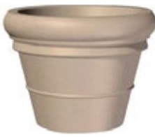
TERRENE II SERIES TF4117 42" DIA. X 31" 1,110 lbs. TF4123 48" DIA. X 36" 1,400 lbs. TF4134 60" DIA. X 45" 2,350 lbs.