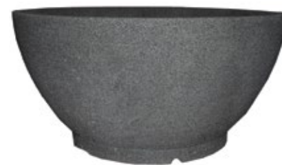
TF4137 108" DIA. X 52" 5,900 lbs.