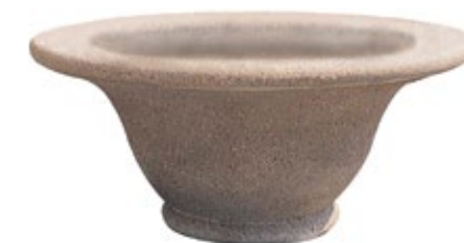
TF4302 60" DIA. X 35" 2,500 lbs.