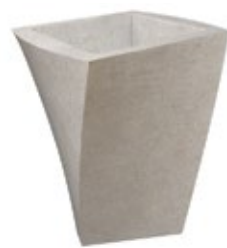
TF4008 27 3/8" X 25 3/4" X 35" 815 lbs.