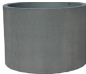
TF4124 48" DIA. X 36" 1,800 lbs. TF4142 54" DIA. X 40" 2,650 lbs.