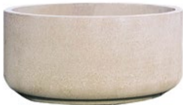
TF4030 30" DIA. X 18" 440 lbs. TF4035 36" DIA. X 24" 750 lbs. TF4135 72" DIA. X 36" 3,725 lbs. Leveling ring comes with TF4135