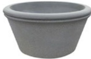
CARGILL SERIES TF4307 30" DIA. X 20" 330 lbs. TF4306 36" DIA. X 24" 600 lbs. TF4308 48" DIA. X 24" 1,185 lbs. TF4305 60" DIA. X 38" 2,015 lbs. TF4309 72" DIA. X 38" 2,950 lbs.