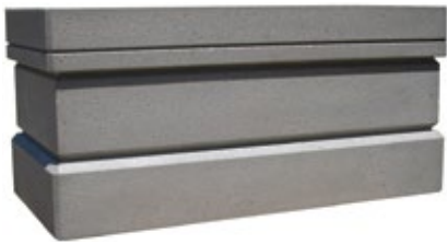
TF4167 64" X 32" X 32" 2,400 lbs.