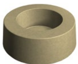
WS125 48" DIA. X 18" 1,800 lbs.