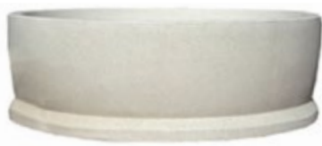
TF4131 72" DIA. X 24" 2,300 lbs.