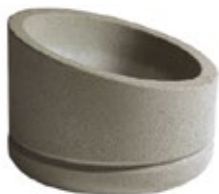
WS4011 24" DIA. X 18" 380 lbs. WS401 30" DIA. X 22" 510 lbs.