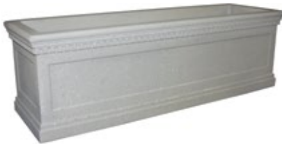
COLONIAL SERIES TF4239 48" X 24" X 20" 795 lbs. TF4238 72" X 36" X 24" 1,775 lbs. TF4176 72" X 30" X 30" 1,900 lbs. TF4177 96" X 30" X 30" 2,400 lbs.