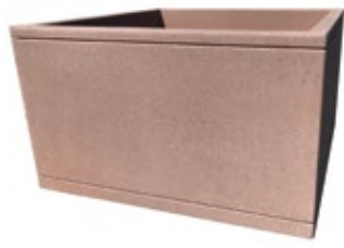
FORM SERIES TF4200 48" SQ. X 30" 1,960 lbs. TF4205 60" SQ. X 36" 3,470 lbs. TF4209 72" SQ. X 36" 4,600 lbs. TF4214 96" SQ. X 36" 6,900 lbs.