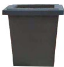
TF4196 36" SQ. X 36" 1,160 lbs.