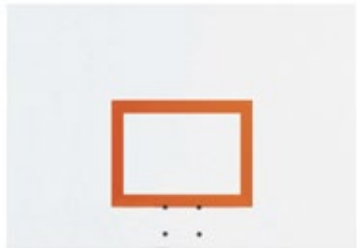
STEEL TF7182 72" X 42" 150 lbs.