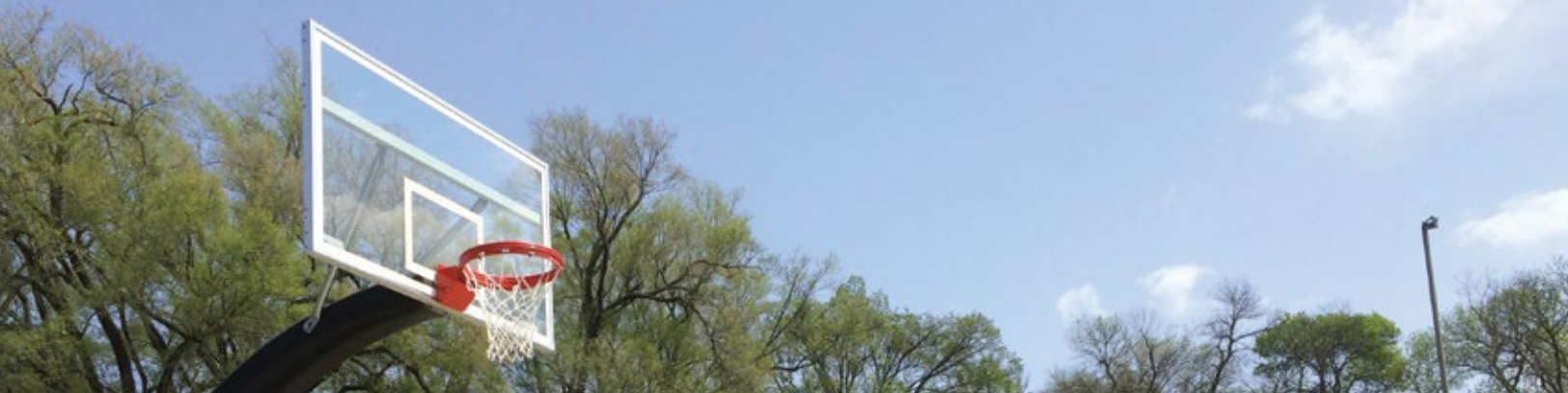
TF7165, TF7175 & TF7174 | Custom Stain