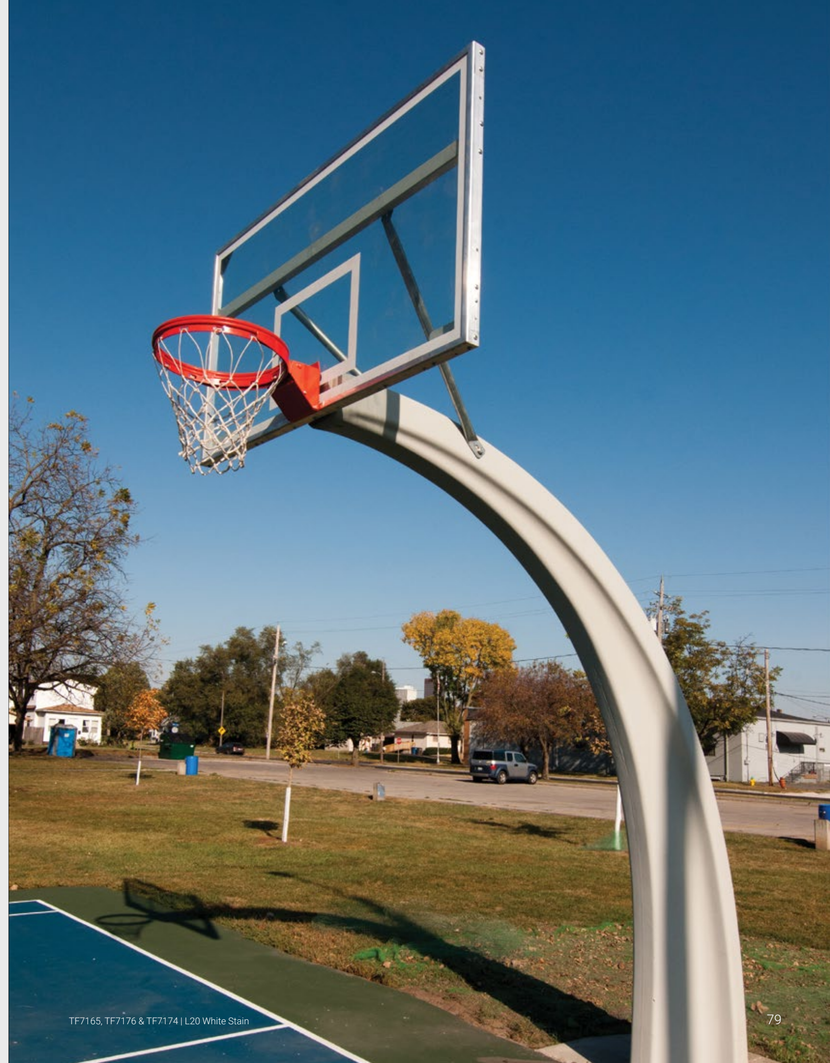
TF7165, TF7176 & TF7174 | L20 White Stain