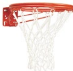
OFFICIAL SIZE RIM TF7174 18 lbs. BREAK-AWAY OFFICIAL SIZE RIM TF7178 29 lbs.