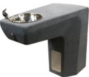
CONCRETE TF7070 39 1/4" X 21" X 34" 780 lbs.