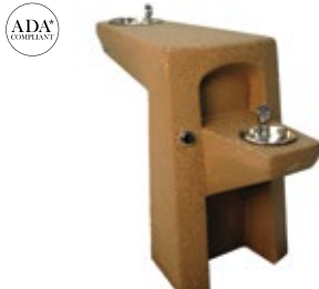
CONCRETE TF7071 48 3/8" X 21" X 34" 780 lbs.*