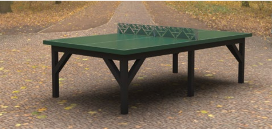
TF7050 106" X 60" X 30" 1,400 lbs. Customize with a logo or design Choose a Metal Powder Coat color for legs & net Choose either Natural Concrete or a Stain for table top