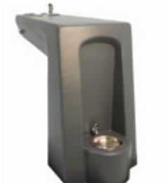
CONCRETE TF7072 48 3/8" X 21" X 34" 780 lbs. Pet bowl included as shown