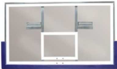
GLASS TF7165 72" X 42" 205 lbs.