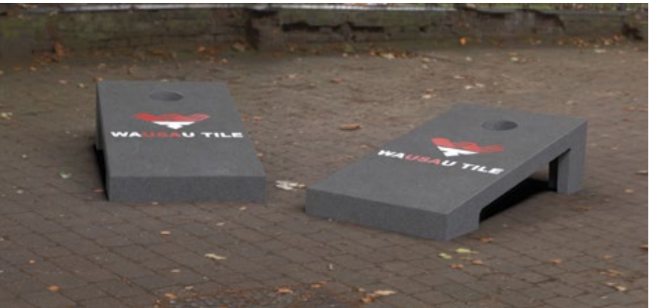
TF7060 48" X 24" X 12" 350 lbs. Customize with a logo or design Choose either Natural Concrete or a Stain