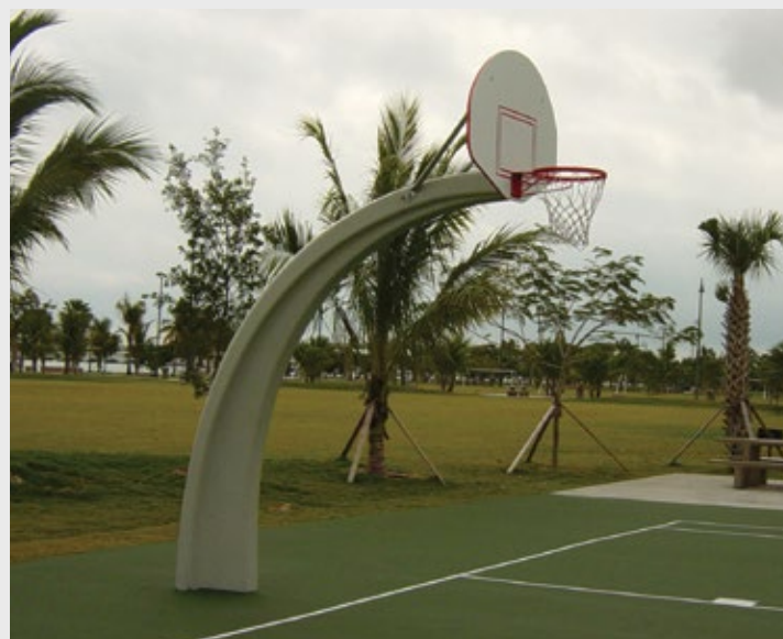
TF7175, TF7169 & TF7174 | L20 White Stain