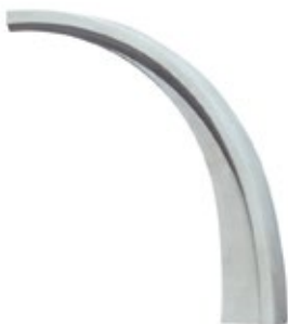
BASKETBALL STANDARD TF7175 160" X 30" X 144" 3,800 lbs.