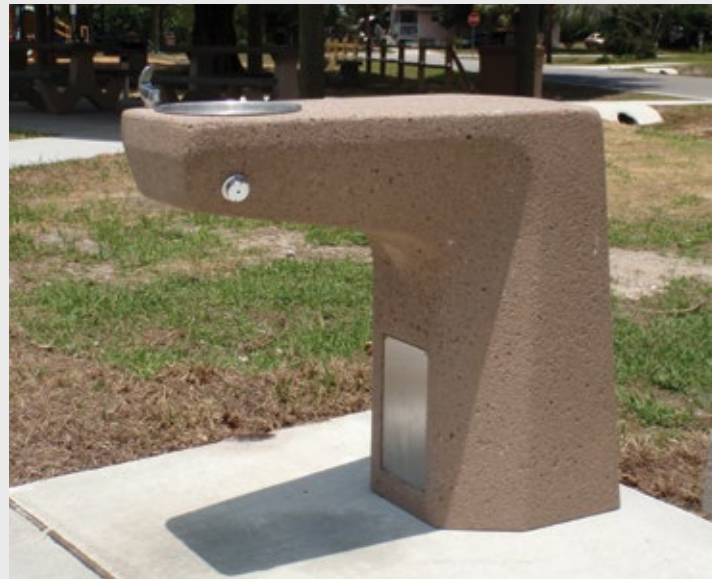
TF7070 | W22 Sand Weatherstone