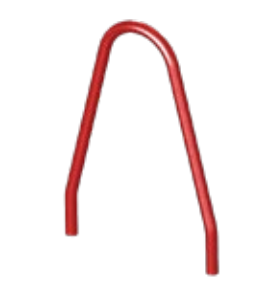
METAL SURFACE MF9026 26" X 38 1/8" 105 lbs. METAL IN-GROUND MF9021 26" X 38 1/8" 105 lbs.