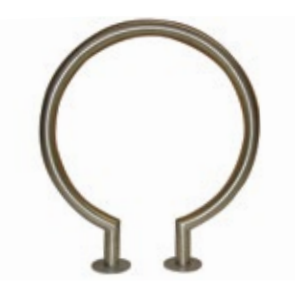
METAL SURFACE MF9048 26" DIA. X 30" 20 lbs. METAL IN-GROUND MF9039 26" DIA. X 43 1/2" 25 lbs.