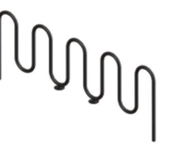
METAL SURFACE MF9010 119" X 36" 140 lbs. METAL IN-GROUND MF9019 119" X 46 3/8" 137 lbs.