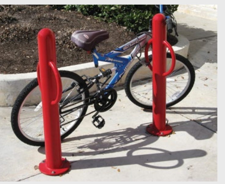
MF9005 | 2 Red Metal Powder Coat

TF7191 | W22 Sand Weatherstone with 72 Aluminum Metal Powder Coat